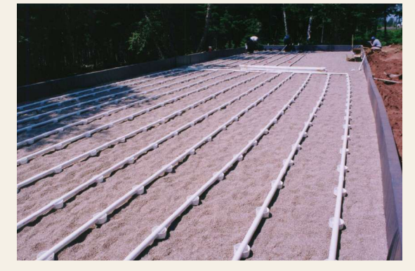
Recirculating Sand Filter during Construction

ETC recommended and designed a Recirculating Sand Filter (RSF) to treat the wastewater to advanced secondary levels. Fractional horsepower effluent pumps micro-dose an open filter bed constructed of coarse sand. The treatment process is extremely low rate and very stable. When properly operated and maintained, the sand should never need to be replaced. The proven RSF system was the first of its kind in New Brunswick.