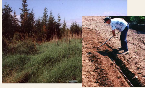
Mature SDI Dispersal Field